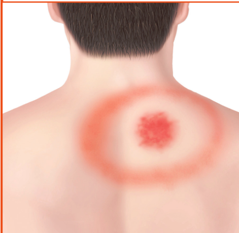
Bull's eye rash on the back.