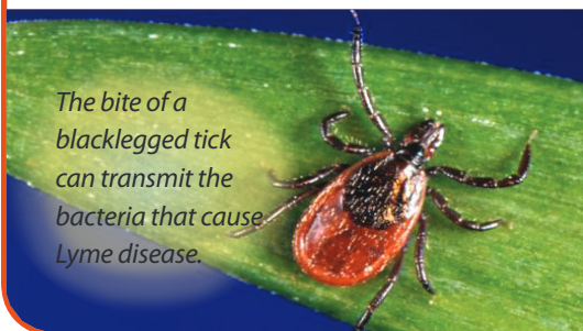
The bite of a blacklegged tick can transmit the bacteria that cause Lyme disease.